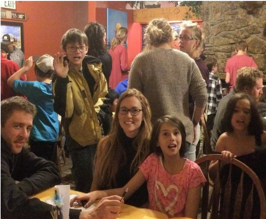
2017 Thanks 4 Giving Celebration - Palisades Restaurant